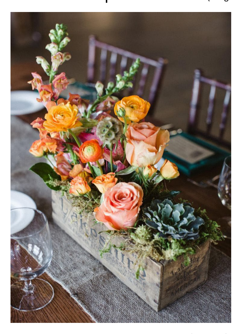
#2 — Table-Top Box or Crate (image small for convenience)

You could also place your Valentine's Day flowers in a wooden box or crate to display as a centerpiece on your dining room table. Although using a crate or wooden box may be the best idea if you have many flowers to present, there are other options. A piece of driftwood, logs,