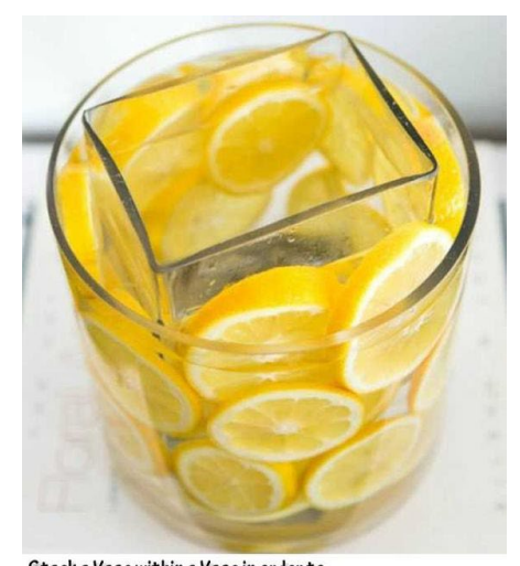
Stack a Vase within a Vase in order to Layer Fruit Slices along the Inside