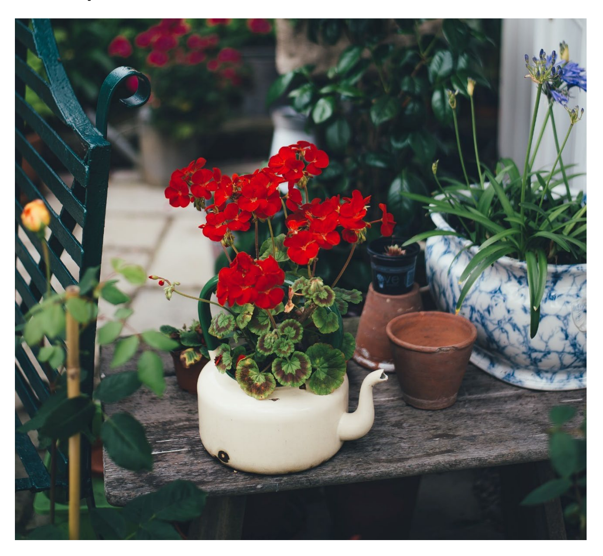
February 17, 2022